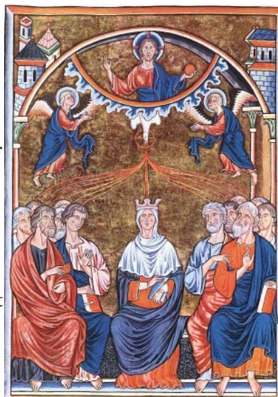
Ingeborg Psalter: Pentecost (before 1210)

COUNSEL (right judgment) - With the gift of counsel/right judgment, we know the difference between right and wrong, and we choose to do what is right. A person with right judgment avoids sin and lives