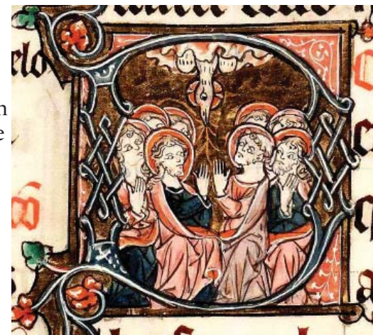
Petrus de Raimbucourt: Pentecost (1323)

FORTITUDE (Courage) - With the gift of fortitude/courage, we overcome our fear and are willing to take risks as a follower of Jesus Christ. A person with courage is willing to stand up for what is right in the sight of God, even if it means accepting rejection, verbal abuse, or even physical harm and death. The gift of courage allows people the firmness of mind that is required both in doing good and in enduring evil, especially with regard to goods or evils that are difficult.