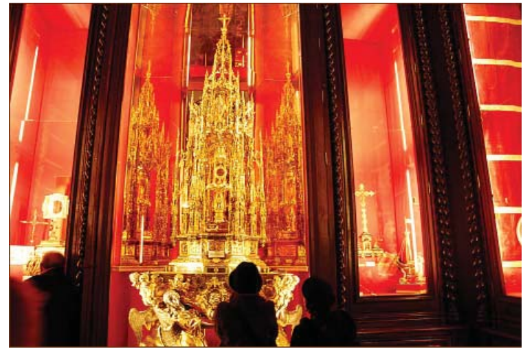
Silver-gilt Corpus Christi monstrance of Toledo, Spain

Croatia, Dominican Republic, East Timor, Liechtenstein, Poland, parts of Germany, Portugal, San Marino, parts of Spain and Switzerland, Grenada, Saint Lucia and Trinidad and Tobago.